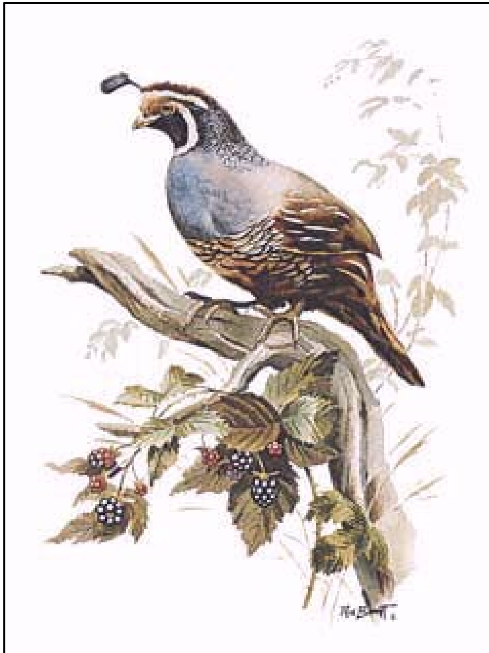
A beautiful painting of a California Quail by unknown artist.

to have a covey of quail around the backyard. This weekly publication can be subscribed to for free by going to my home page on the internet: http://www.lelandhayes.com .